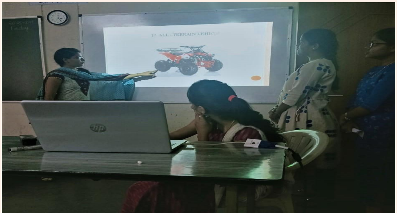
Students making presentations on organizational issues and challenges