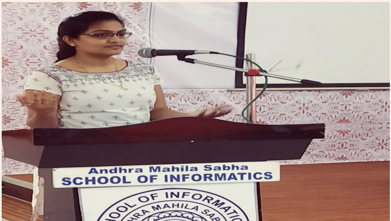
Students participating in Jam Session