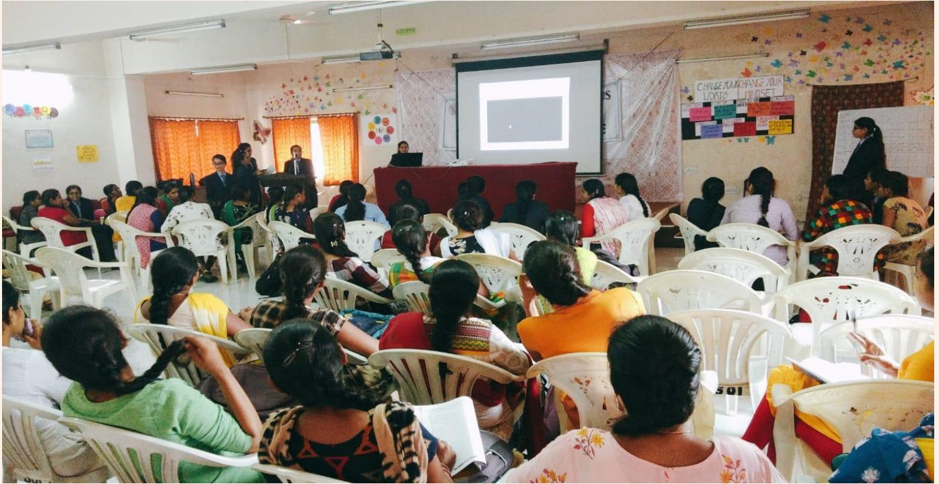
Students participating in Business Quiz