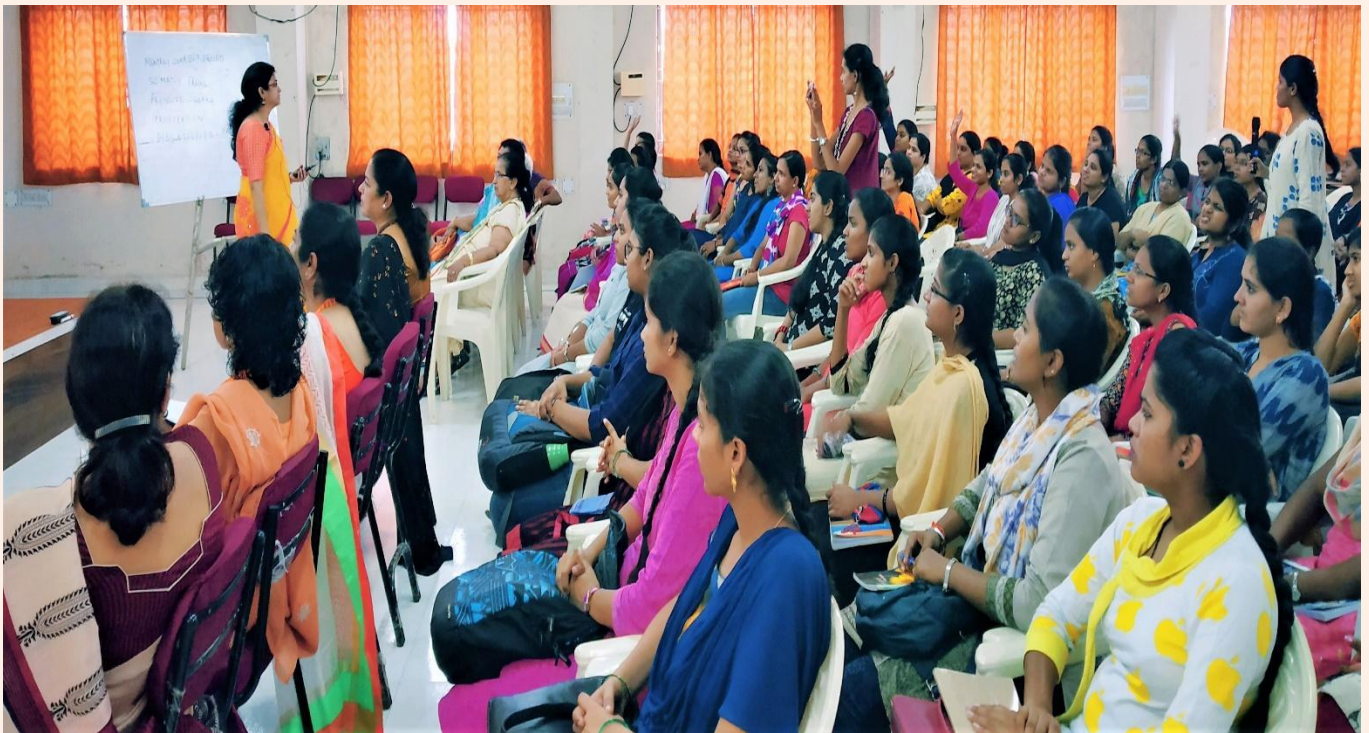
Students interacting with speaker during Guest Lecture